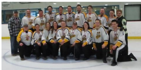
GOLD - Crazy Knights