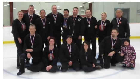
SILVER - Ice Devils