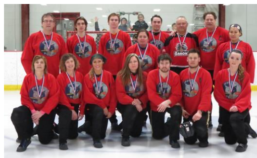
BRONZE - Silver Foxes