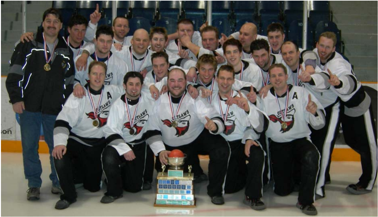
2009 Senior Provincial Champions Odessa Outlaws