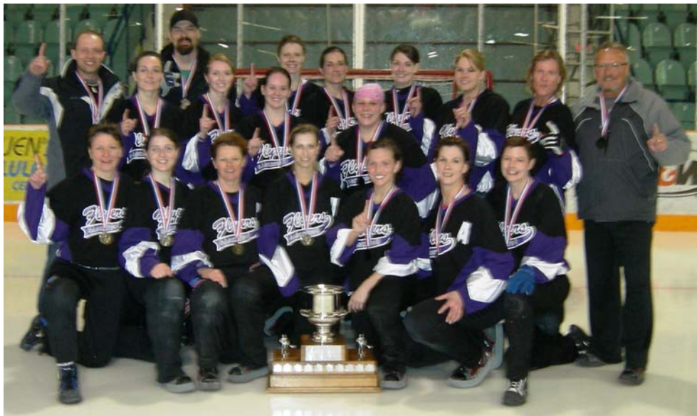
2009 Senior Provincial Champions Saskatoon Flyers