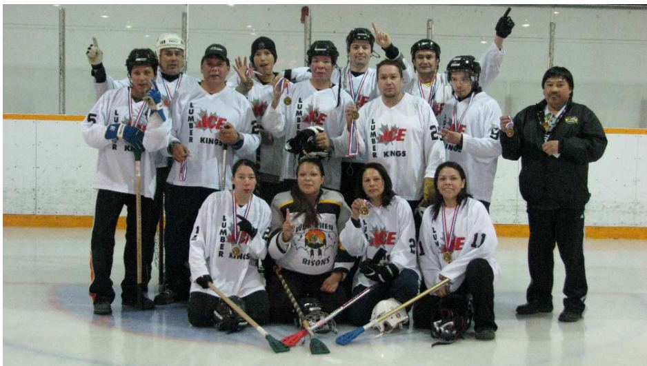
Recreation Division Winners Waterhen Ace Lumber Kings