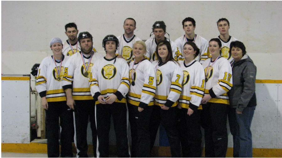
Open Division Winners Odessa