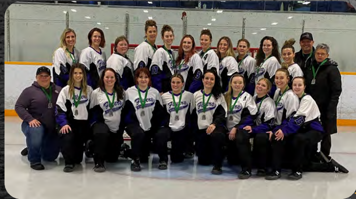
Silver - Saskatoon Flyers