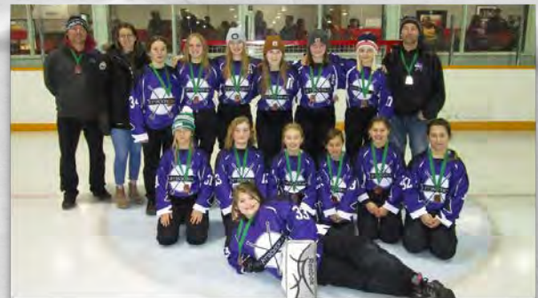
BRONZE - ABERDEEN ATTACKERS