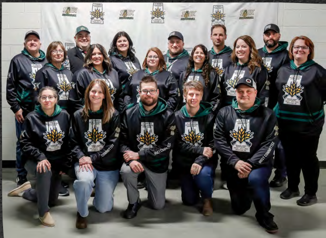
2023 U20 Nationals Host Committee Members