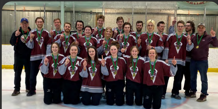
Gold - Park Valley Vikings