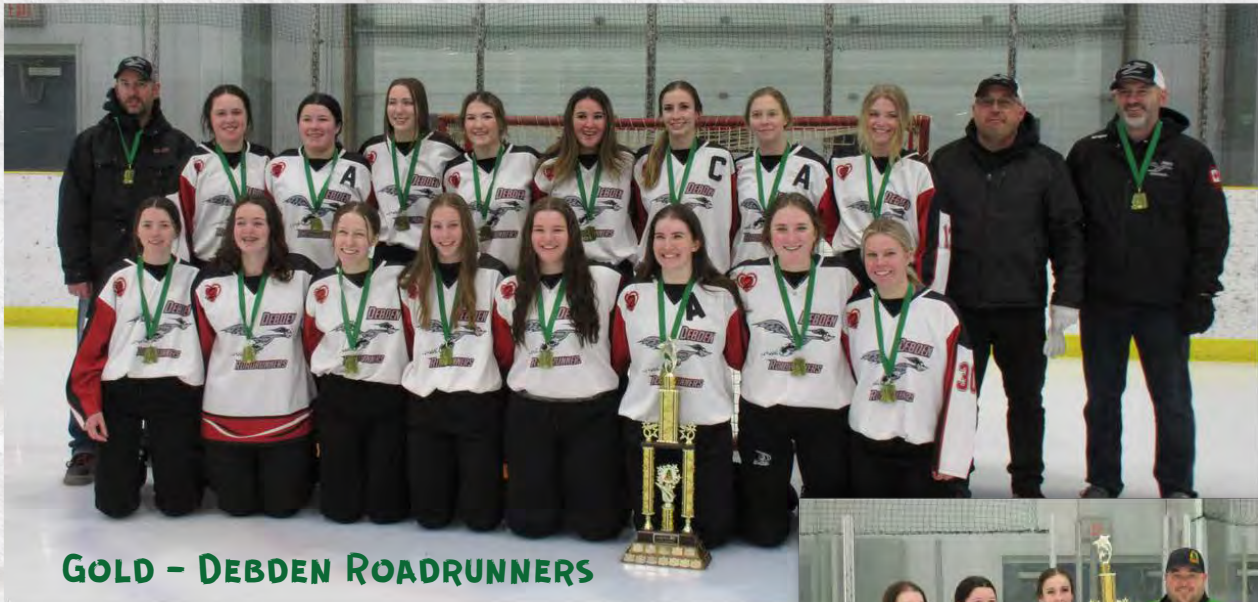
GOLD - DEBDEN ROADRUNNERS