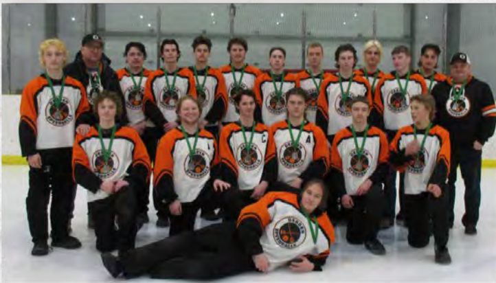
SILVER - DEBDEN SPEEDBALLS