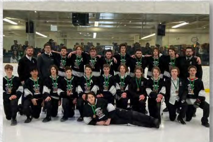
BRONZE - ODESSA BANDITS