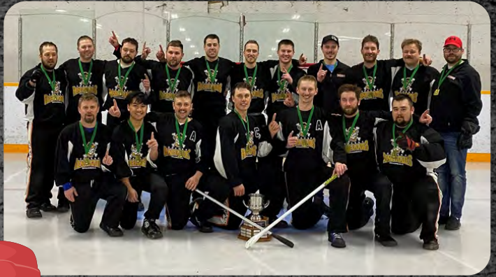
Gold - Odessa Renegades