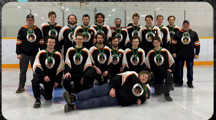
Bronze - Debden Speedballs