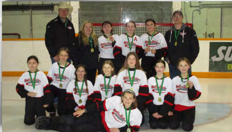
GOLD - BIG RIVER CRUSADERS