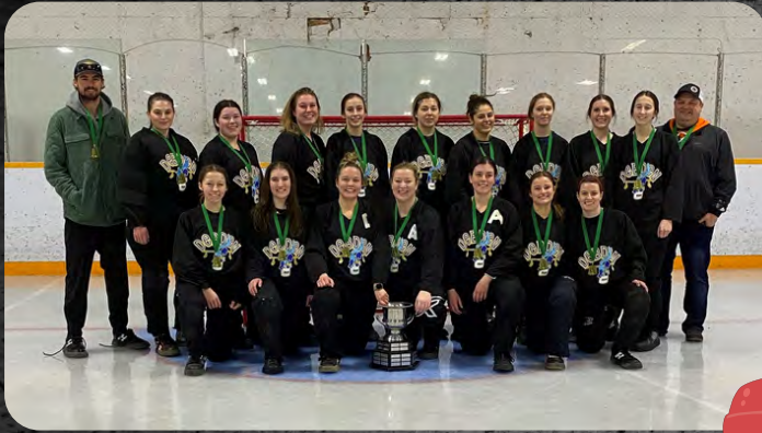
Gold - Debden Roadrunners