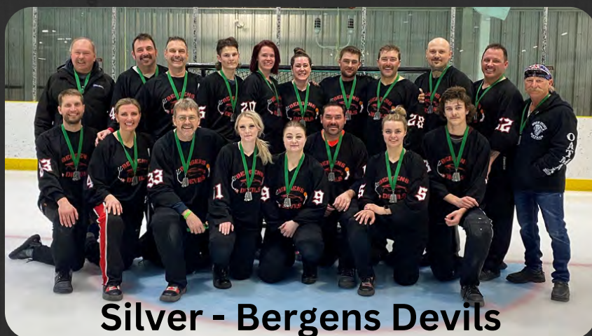
Silver - Bergens Devils