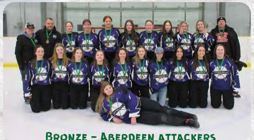
BRONZE - ABERDEEN ATTACKERS