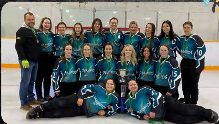
Bronze - TriTown Dynamos