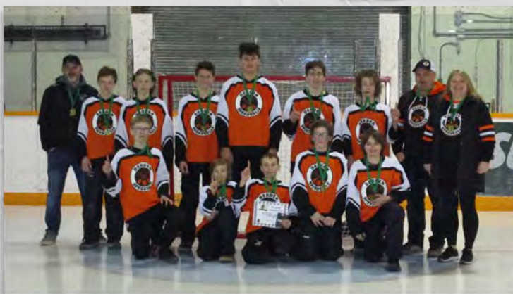
GOLD - DEBDEN SPEEDBALLS