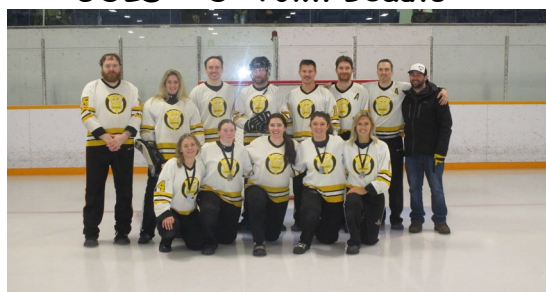
GOLD - O-Town Beauts