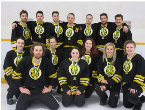
GOLD - O-Town Beauts