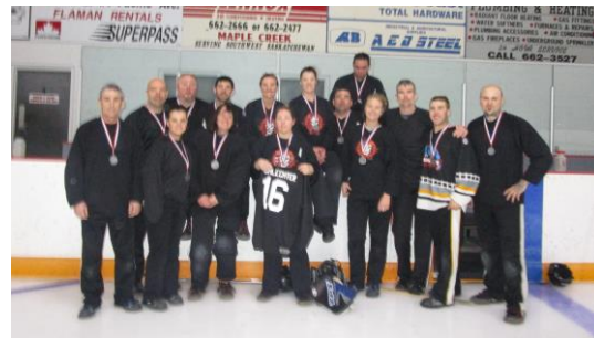
SILVER - Ice Devils