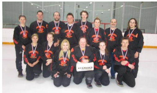
BRONZE - Saskatoon Kings