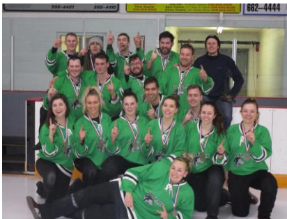
GOLD - Wolf Pack