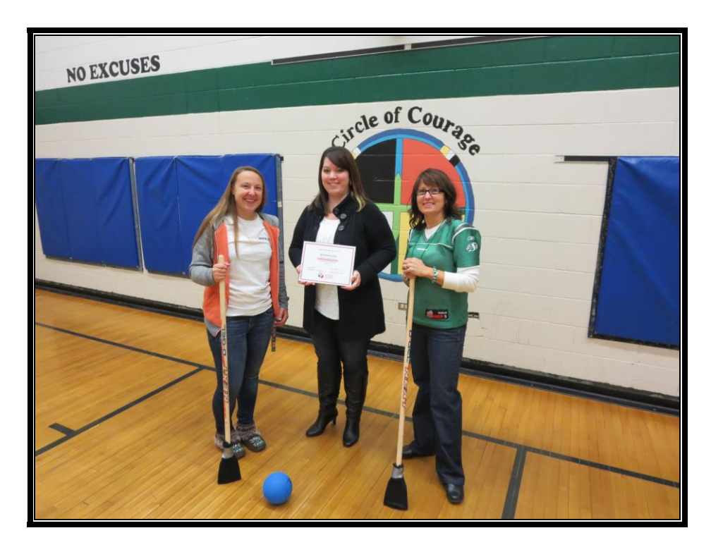
National Launch of the "Lace to the Top" Program – October 21-24, 2013. Albert School received 40 brooms, 25 balls, shoe tags, instructional DVDs.