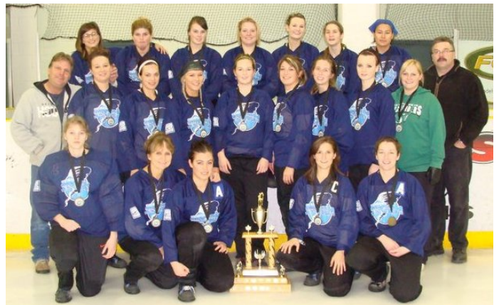
Gold Medal Winners – Odessa Storm