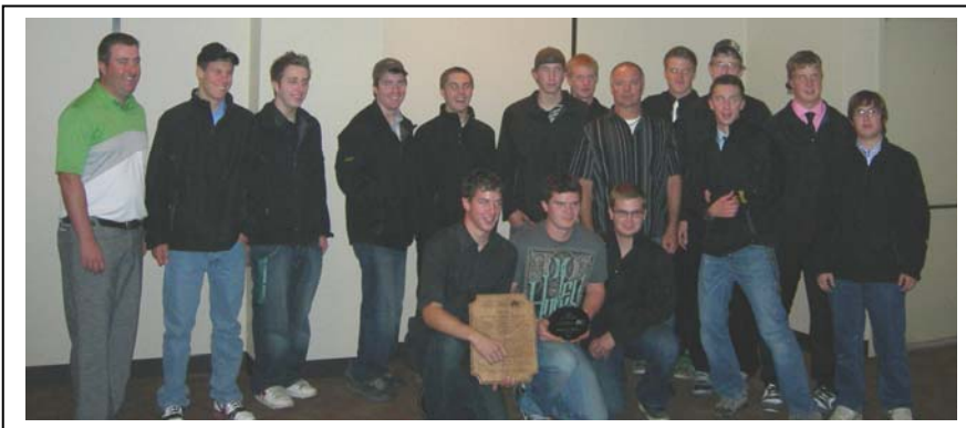
Team of the Year – Balgonie Clippers